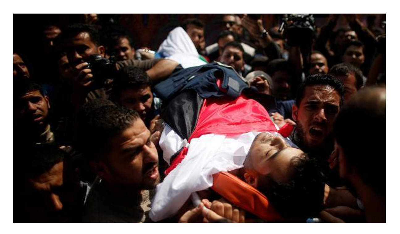
On April 7, 2018 a Palestinian journalist Yaser Murtaja working for a Gaza based free media company was shot in cold blood by Israeli occupiers.

2 journalists have been killed in 2018 alone by Israeli occupying forces through illegal and unilateral attacks on peaceful protests.