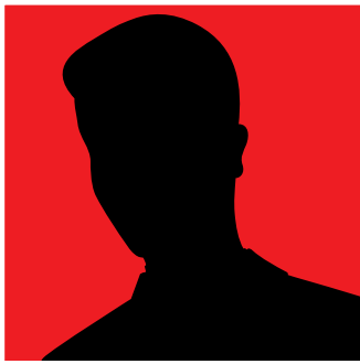
■ Hidden Picture