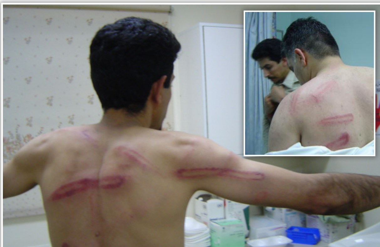
Human rights activator Abul Hadi HI Khawaja & Nabil Rajab after the torture (old picture)

The Following is a brief about the character of each of them, and the powers and responsibilities that assumed by each one: