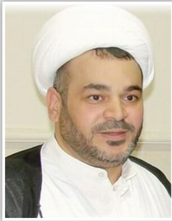
Mohammed Habib Al Mekdad

Accused of torture: Nasser bin Hamad Al Khalifa