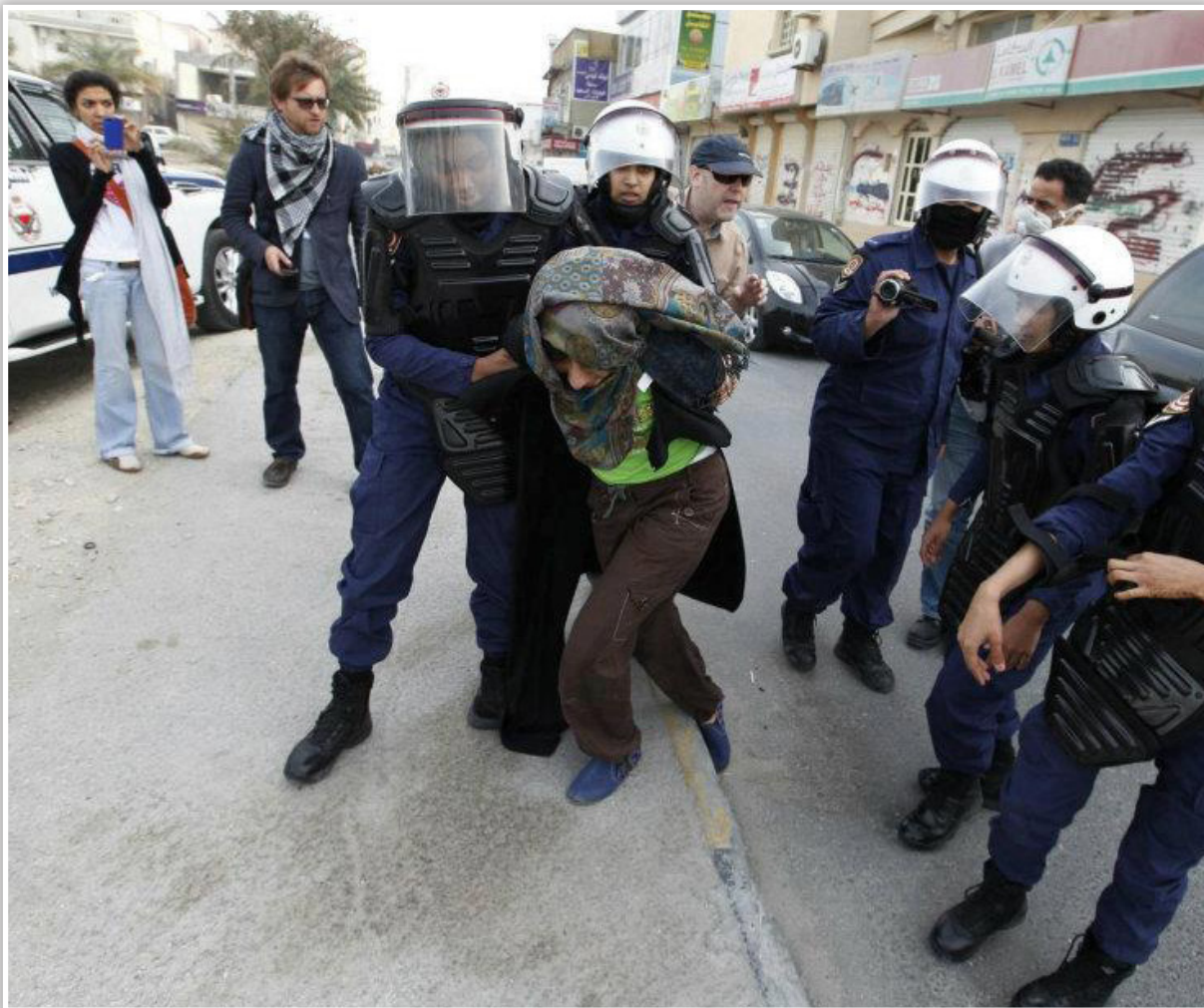
Security agents arrest a Bahrainian citizen exercising free expression