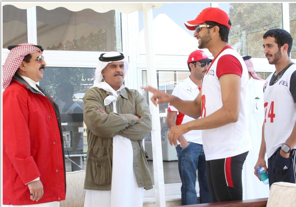
Bahrain's King conversing his two sons, Nasser and Khalid bin Hamad involved violations

He was fired from his work in September 2011 because of the complaints against him for assault, abuse, and human rights violations.