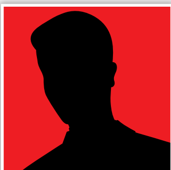
■ Hidden Picture